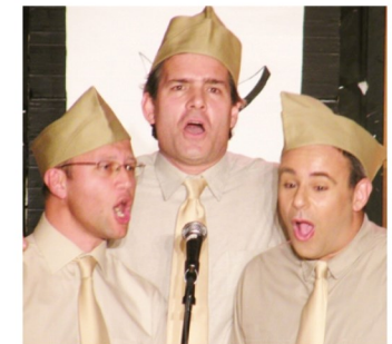
Sentimental Journey 2013

Create a positive rapport among residents and visitors alike