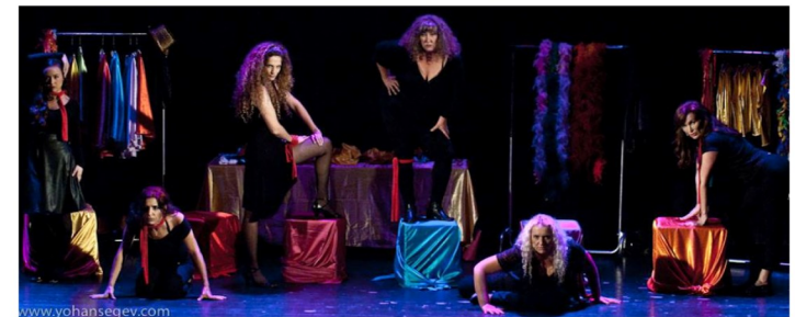
Broadway Bubba 2017